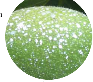
Sample of ideal coverage

• Apply each application in the opposite direction of the previous application.