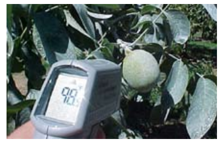
A protective film of Surround reduces the temperature of sun-exposed walnuts.