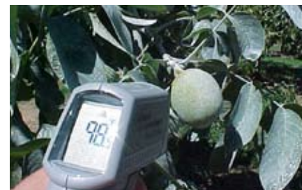
A protective film of Surround reduces the temperature of sun-exposed walnuts.

TESSENDERLO KERLEY, INC. 2255 North 44th Street Suite 300 Phoenix, AZ 85008-3279