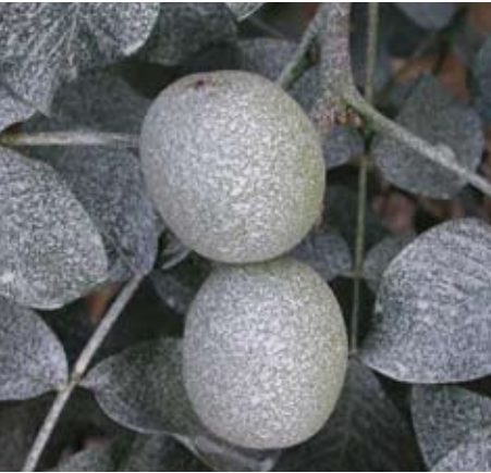
Surround Effects on Walnut Husk Fly and Codling Moth in Walnuts D Hicks, D Hulst; California, 2004