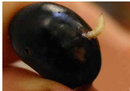
Olive Fruit Fly Maggot

Developed in conjunction with the United States Department of Agriculture (USDA), Surround Crop Protectant is formulated to suppress insect activity and can be a valuable tool in olive IPM programs. Surround is an EPA-registered insecticide that can help reduce the damage caused in olives by the olive fruit fly, thrips and other insect pests. In addition, Surround may be used to maximize the effectiveness of conventional insecticides by avoiding their overuse, thus minimizing the likelihood of insect resistance.