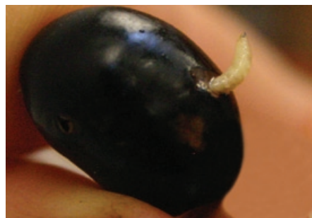
Olive Fruit Fly Maggot

Developed in conjunction with the United States Department of Agriculture (USDA), Surround® Crop Protectant is formulated to suppress insect activity and can be a valuable tool in olive IPM programs. Surround is an EPA-registered insecticide that can help reduce the damage caused in olives by the olive fruit fly, thrips and other insect pests. In addition, Surround may be used to maximize the effectiveness of conventional insecticides by avoiding their overuse, thus minimizing the likelihood of insect resistance.