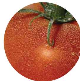
Sample of ideal coverage