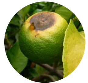
Severly damaged lemon

Purshade reduces solar stress in crops by protecting the foliage and fruit from damaging ultraviolet (UV) and infrared (IR) radiation while still allowing photosynthesis to occur. Engineered with advanced reflectance technology and based on calcium carbonate, a highly reflective mineral, Purshade has been shown to reduce sunburn damage and minimize overall heat stress. Purshade effectively reflects harmful UV and IR radiation away from plants.