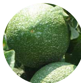
Sample of ideal coverage