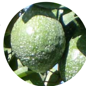
Sample of ideal coverage